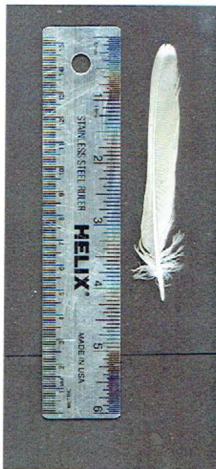
Ventral View of LR6