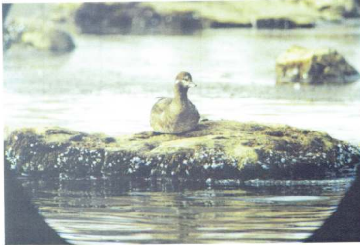
Harlequin Duck, 1/20/01, La Plata County