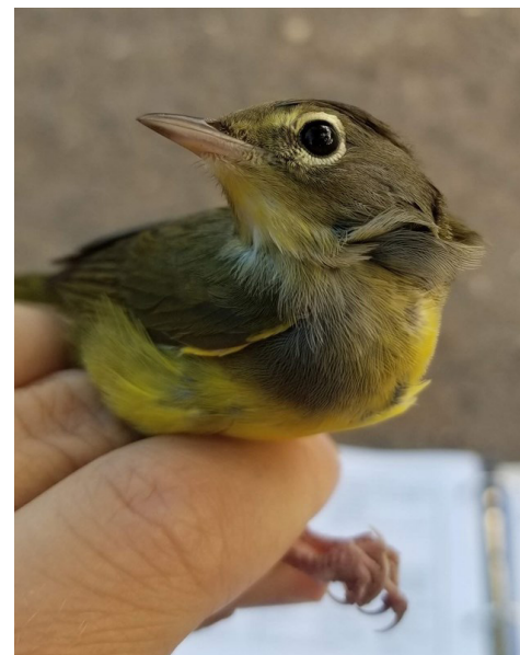
Mourning Warbler, 9/17/2019, Mesa County.

LeConte's Sparrow – Ammodramus leconteii (2018-037; 5-2, 4-3, 3-4): A bird was initially heard at the small pond south of Stewart's Pond, Weld, on 25 Mar 2018. The initial recording was made at 5:20 am when it was still dark. The observers returned when it was light, and very briefly saw a bird that looked like an Ammodramus sparrow. This report sparked a vigorous debate about whether the recorded calls could definitely be associated with LeConte's Sparrow, but the consensus in the 3rd round was that this record should perhaps best be left as an Ammodramus species.