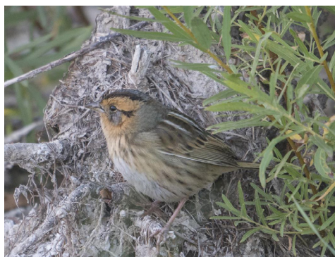
Nelson's Sparrow, 9/25/2020, Arapahoe County.

Mourning Warbler – Geothlypis philadelphia (DD*, JB; 2020-065; 7-0): An adult male in breeding plumage was seen at Hale, Yuma, on 16 May 2020.