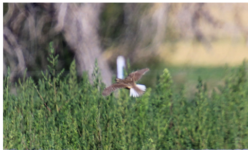
Chihuahuan Meadowlark, 7/25/2015, Boulder County.

of the Lilian's race at McIntosh Lake in northwest Longmont in the summer of 2015. A detailed history of the Lilian's