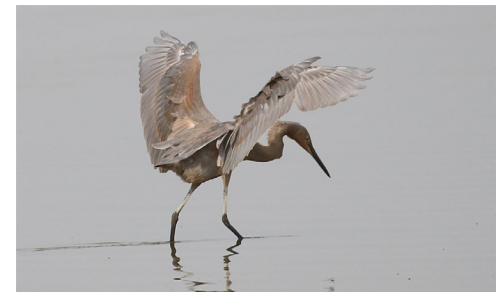
Reddish Egret, 9/18/2020, Morgan County.