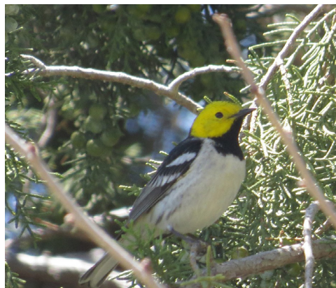
Hermit Warbler, 5/5/2020, Bent County.

Parasitic Jaeger – Stercorarius parasiticus (RH*; 2019-033; 7-0): An adult was photographed at Warren Lake, Larimer, on 12 Oct 2019.