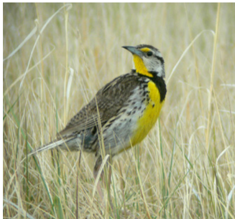
Chihuahuan Meadowlark, 7/8/2006, Pueblo County.