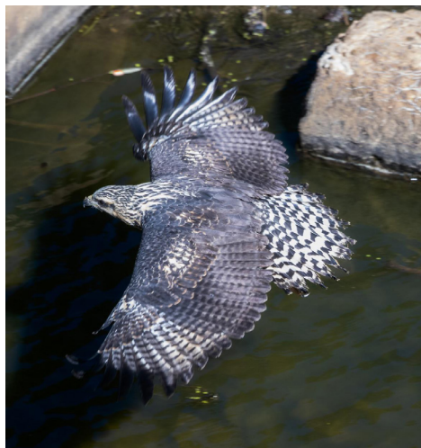
Common Black Hawk, 9/12/2020, Teller County.

Scarlet Tanager – Piranga olivacea (CD*; 2020-052; 7-0): An adult male in breeding plumage was seen in Nucla, Montrose, on 24 and 25 May 2020.