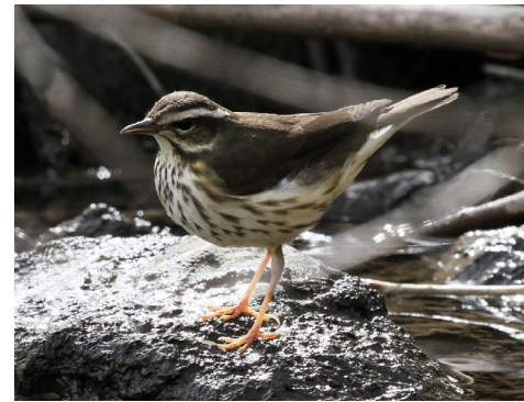
Louisiana Waterthrush, 4/23/2020, Larimer County.

Glaucous-winged Gull – Larus glaucescens (PB*; 2020-007; 6-1): An adult was seen at Warren Lake, Larimer, on 1 Mar 2020.