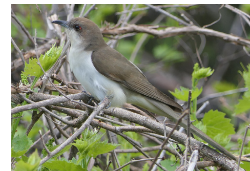
Black-billed Cuckoo, 5/15/2019, Baca County.

Black-billed Cuckoo – Coccyzus erythrophthalmus (RSi*; 2019-034; 7-0): An adult in breeding plumage was photographed at Carrizo Canyon Picnic Area, Baca, on 15 May 2019.