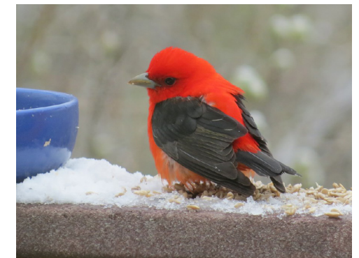
Scarlet Tanager, 4/29/2019, Boulder County.

Scarlet Tanager – Piranga olivacea (AD*; 2019-054; 7-0): An adult male was seen at a feeder in Lyons, Boulder, on 29 and 30 Apr 2019.