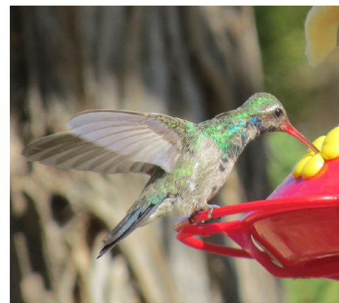
Broad-billed Hummingbird, 10/19/2019, Mesa County.

Hermit Warbler – Setophaga occidentalis (SA*; 2020-036; 6-1): An immature bird was photographed a little northeast of Durango, La Plata, on 31 Aug 2020.