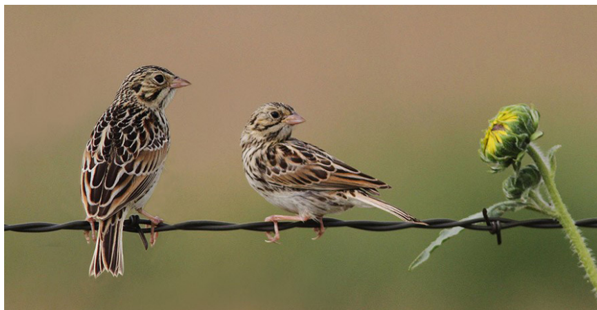
Baird's Sparrow, El Paso. 27 August 2014.

EASTERN TOWHEE – Pipilo erythrophthalmus (CS & ; 2013-272; 6-1): A male was seen on November 17, 2013 at Banner Lakes SWA, which is a few miles east of Hudson, Weld . (DB; 2015-033; 6-1): A female was seen on December 27, 2013 at the Adams Open Space in Fountain, El Paso . (SM & ; 2014-068; 7-0): An immature female was seen on May 24, 2014 near Julesburg, Sedgwick . (SM; 2014-069; 7-0): A male was seen on May 25, 2014 at Tamarack Ranch SWA, Logan . (SM & ; 2014-140; 7-0): Another male was seen on September 13, 2014 at the Fox Ranch, which is on Highway 36 between Joes and Idalia, Yuma . (AV & ; 2014-170; 5-2, 6-1): A male was seen on December 5, 2014 at the Rocky Mountain Arsenal State Wildlife Refuge, Adams .