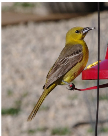
Hooded Oriole, Montrose. 01 May 2014.