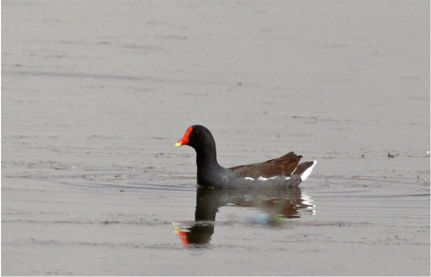
Common Gallinule, Otero. 27 May 2014.

COMMON GALLINULE – Gallinula galeata (BM & ; 2014-079; 7-0): A bird was seen on May 27, 2014 at a private lake near Rocky Ford, Otero . This is the 9 th documented sighting of this species in Colorado.