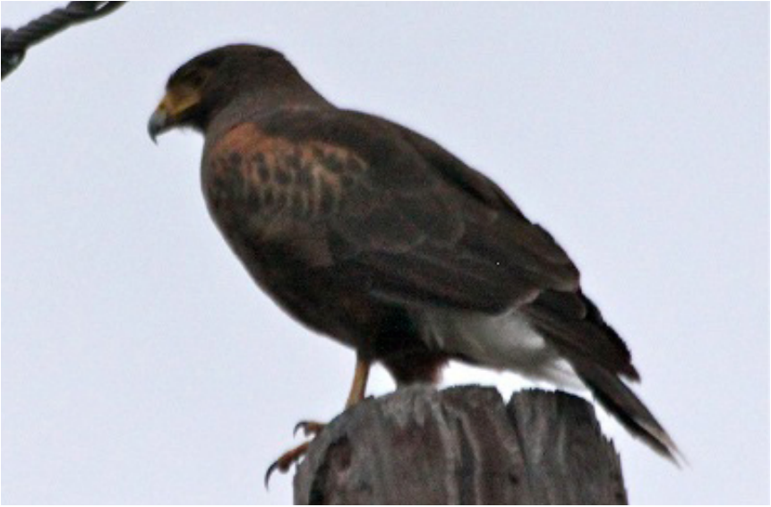
Harris's Hawk, Costilla. 12 July 2014.