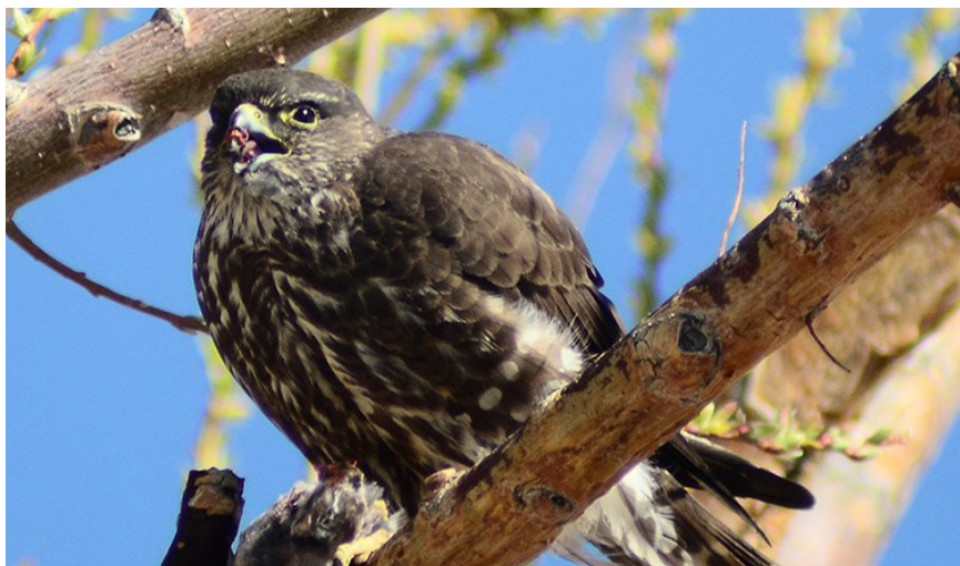
Black Merlin, Pueblo. 19 March 2014.

SWAINSON'S THRUSH (RUSSET-BACKED) – Catharus ustulatus ustulatus (SM; 2013-143; 7-0): A bird of this Pacific coast subspecies of Swainson's Thrush was seen on May 11, 2013 below the dam at Two Buttes SWA, Baca . (SM; 2013-146; 6-1): Another bird was seen on May 12, 2013 at Tempel Grove, Bent . (SM; 2013-160; 7-0): A third bird of this race was seen on May 28, 2013 at Crow Valley Campground, Weld . The status of the Russet-backed subspecies in Colorado is discussed in Mlodinow et al. (2013).