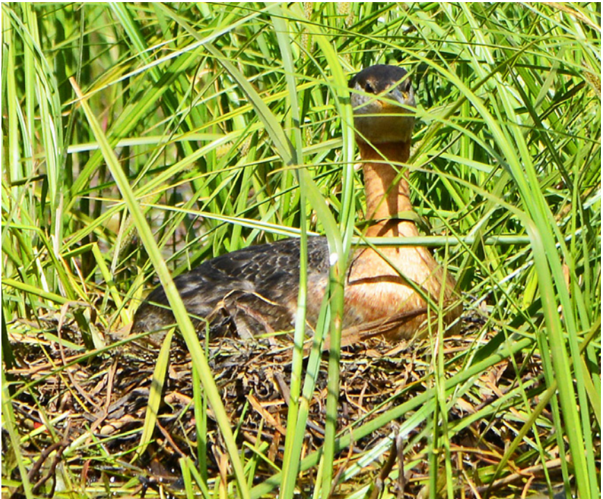
Red-necked Grebe, Jackson. 02 June 2014.

RIVOLI'S HUMMINGBIRD – Eugenes fulgens (JD & , SM & ; 2014-159; 7-0): A female was seen at a residence just north of Coal Creek Canyon, Boulder , on October 27 and November 1, 2014. The bird was regularly seen at this location for approximately one week in late October and early November.